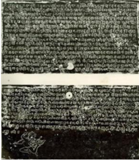
Harsola Grant A, 949 CE

10 th century A.D., this vast empire collapsed, and was divided between a number of independent ruling dynasties. The regal insignia of Paramāra is the garuda in human form. This dynasty reached its pinnacle under the reign of Munja's nephew, Bhoja, whose realm extended from Vidisha in the east to Sabarmati in the west and from Chittor in the north to Konkan in the south. The oldest surviving Paramāra inscription, which was written by the 10th-century ruler Siyaka, has been found in Gujarat. Around 972 A.D., Siyaka conquered the Rāṣṭrakūṭa capital Manyaketa and established Paramāra as a sovereign state. The original inscription was found in the Paṭanārāyaṇa temple near Girvar located 4 miles west of Madgusudana in Sirohi State. The inscription consists of 39 lines covering a space of 2ft. 6 inches broad by 1 ft.11 inches high. The character depicted in the inscription are nāgari. The language is Sanskrit, lines 1-35 are written in verses (nos. 46). Lines from 35 to the end are in prose. The inscription is well maintained. The inscription is of great importance in connection with Paramāra history.