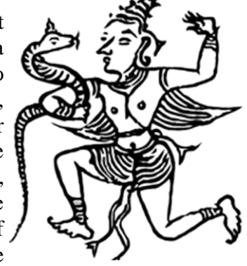
Royal Emblem of Paramāra

Between the 9th and 14th centuries, the Malwa and adjacent regions of west-central India were under the control of the Paramāra Dynasty. They belong to Paramāra clan of the Rajputs. They are also known by the name; Garoḍās, Luhāras, Kōḷīs etc. In the early years, having been hard pressed by the Rāṣṭrakūṭas, surrendered Malwa to their control, which was thereafter entrusted to the charge of Upendra, the founder of the Paramāra Dynasty. In the early part of the 10 th century A.D., the Paramāras reconquered Malwa and established sovereignty over the greater portion of Northern India. The kingdom extended up to the foot of the Himalaya on the north, North Bengal on the east, the Narmada on the south, Saurāṣṭra, Sind, and the Punjab on the west. In the middle of the